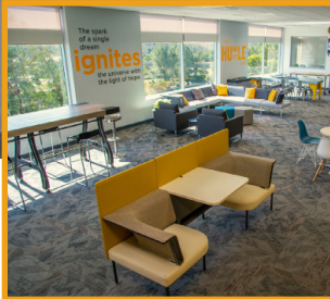
ignite sparked by BBB San Diego, California

BBB Accredited Businesses used our facilities for a total of over 1,500 hours in 2023