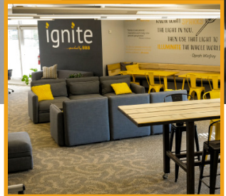
ignite sparked by BBB Phoenix, Arizona

Additional meeting space is available at the Prescott, Lake Havasu City, Yuma, and Newport Beach Campuses.