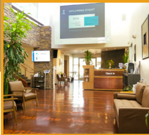
BBB Business & Community Center Phoenix, Arizona